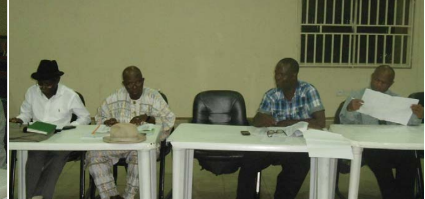
NSE Port Harcourt Branch Executive Committee members in an emergency meeting that was held on Monday 27th January 2014.